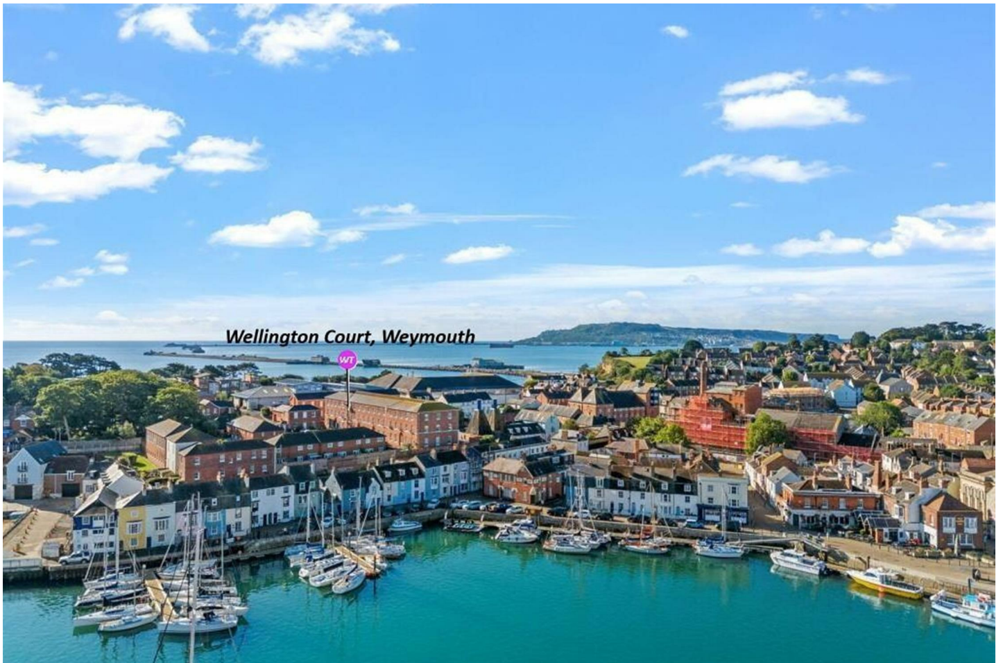
Wellington Court, Weymouth